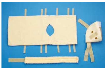
Standard Replacement Patient Pad Kit