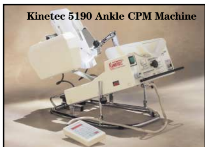
Kinetec 5190 Ankle CPM Machine