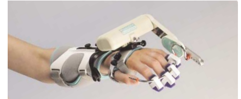
Maestra Portable Hand CPM