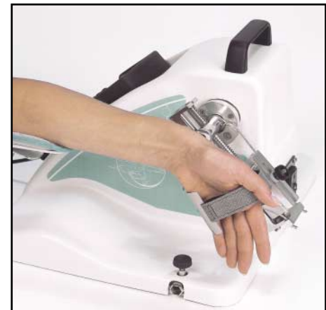
Maestra Wrist CPM