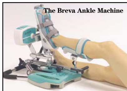
The Brevia Ankle Machine